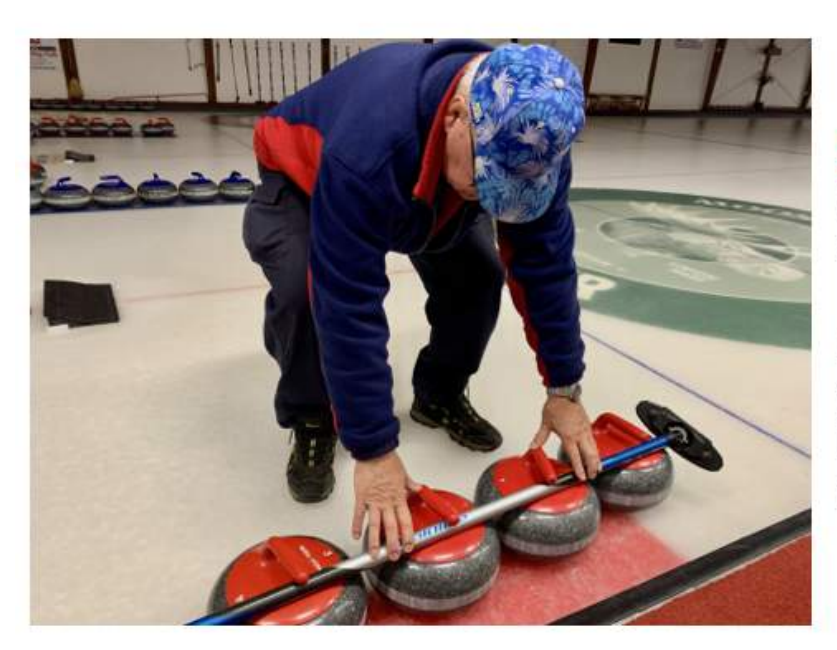
Don't do this to move several rocks at once.

Handles are prone to break. Instead push rocks separately.