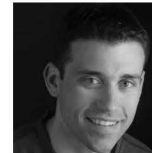
WHITNEY QUAIL CLUB SECRETARY