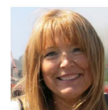
LANA MACKENZIE COMMUNICATIONS