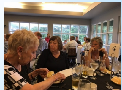
MCC Daytime members