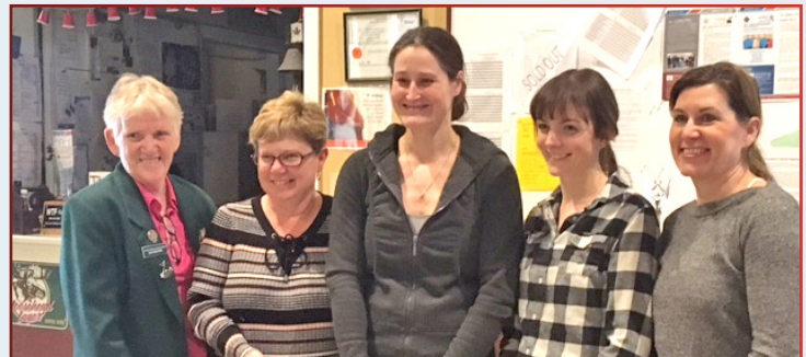
LCA Gillies Metcalfe team