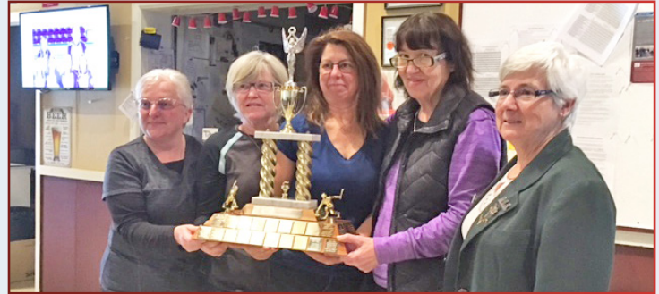
LCA Gillies Morrisburg team