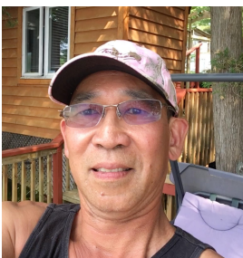
Special Events Kent Yuyitung