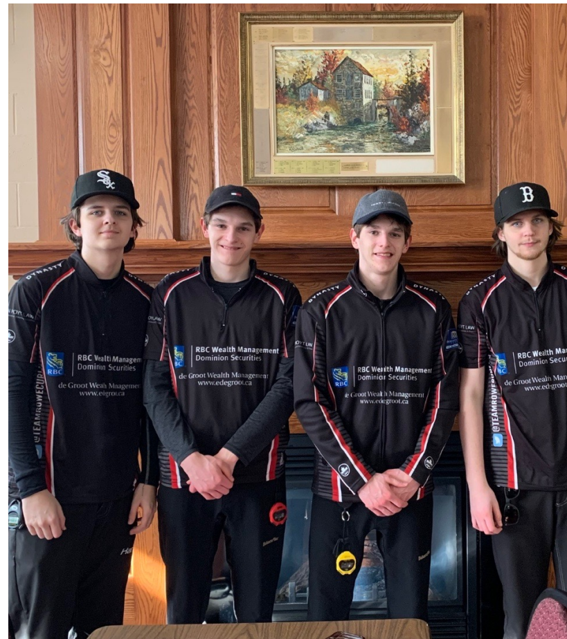
Team Rowe L to R