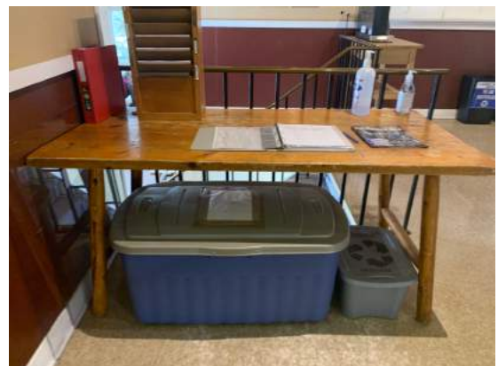
Lost & Found box

The table top curling board is set up under the window in the lounge, where the Lost & Found table used to be. Please note that lost items can again be retrieved from their former spot in the big blue bin under the table at the top of the stairs.